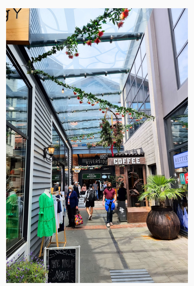
WANDER DOWN RIVERSIDE LANE

Arrive by the famous Christchurch Tram, take a wander down Riverside Lane and then join us at the Riverside Market for an evening of fine food & drinks.