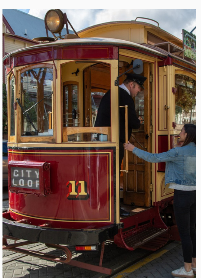
ARRIVE BY THE CHRISTCHURCH TRAM

The Christchurch Trams offer a unique experience combining history and sightseeing. Our beautifully-restored heritage trams are one of the city's best loved attractions. You'll be dropped off on Cashel Street, at the entrance to Riverside Lane. Take a walk down to the main Riverside Market building, to begin your VIP evening event.