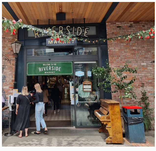
JOIN US AT THE CASHEL STREET ENTRANCE